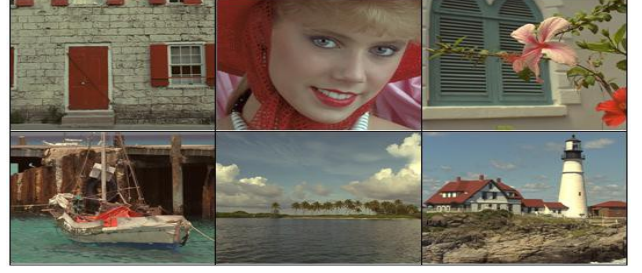
Figure 2: Sample images from the TID2008 database.

In order to train and test the efficiency of the proposed approach, we need both training and test sets. TID 2008 image database [13] is chosen for this purpose. This image database contains 17 types of degradations with 100 images per distortion using 25 reference images (i.e. 4 distortion levels per image and per degradation). Fig.2 shows some reference images from the TID 2008 database. Table 3 lists the degradation types available in the database. The MOS values for all the degraded images are also available.